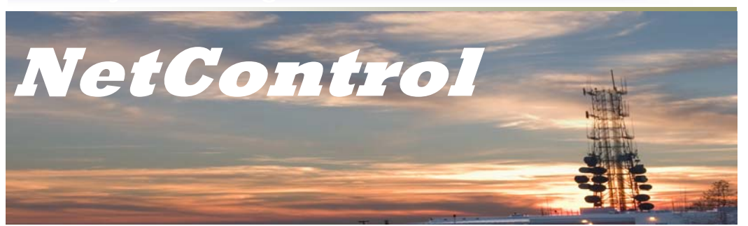
Newsletter of the County of Orange Radio Amateur Civil Emergency Service