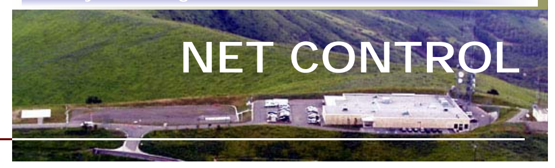
Newsletter of the County of Orange Radio Amateur Civil Emergency Service