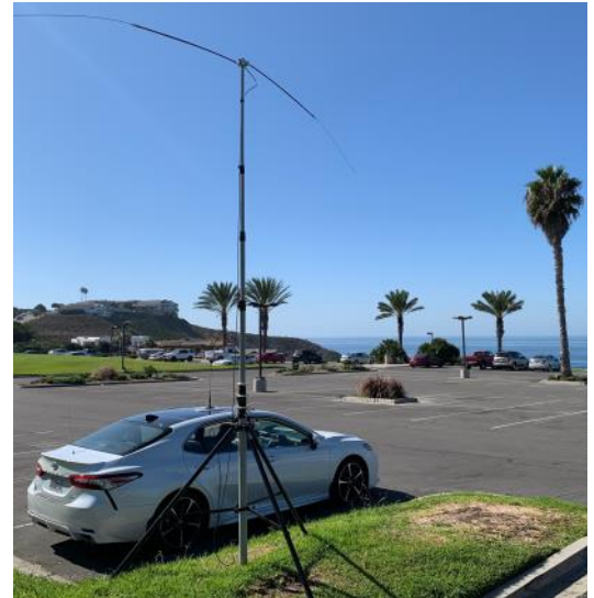
Sgt. Bob McFadden, KK6CUS, checked the 2-m and 70-cm repeaters from Strand Beach in Dana Point and contacted the OC EOC via 60-m NVIS (using a dual-Hamstick dipole) and via Winlink with a Kenwood HT and laptop.