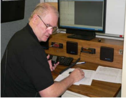
inbound messages at Position 2.