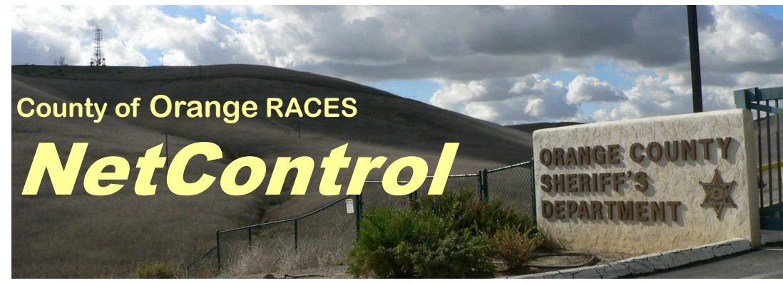
Newsletter of the County of Orange Radio Amateur Civil Emergency Service

Orange County Sheriff's Department Communications & Technology Division