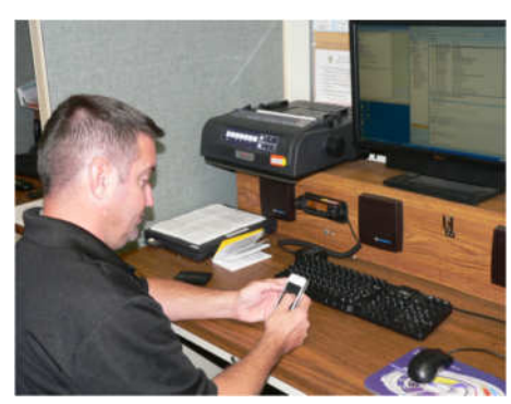
link station at Position 3.