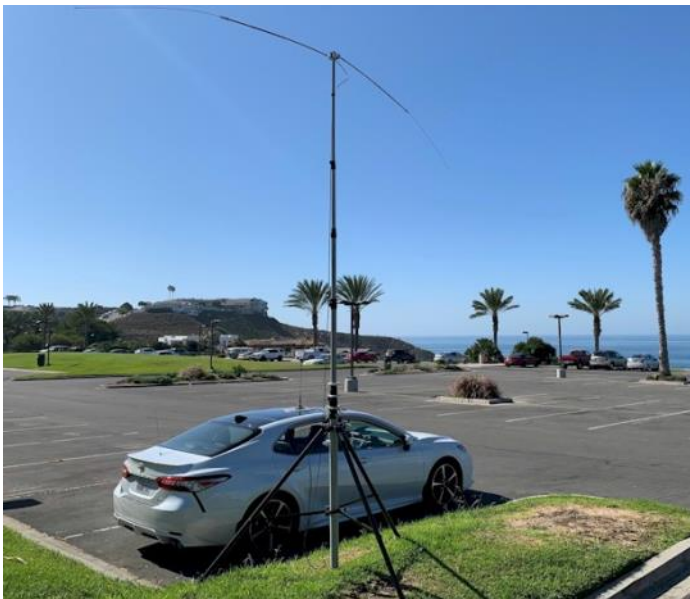
KK6CUS portable station in Dana Point during City/County RACES & MOU ACS Exercise on October 5, 2019.