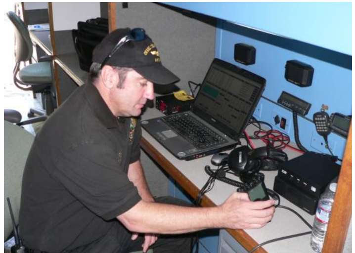
KK6CUS in OCRACES van at Field Day with Orange County Amateur Radio Club on June 25, 2016.