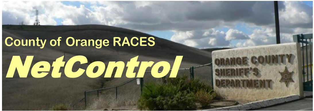
Newsletter of the County of Orange Radio Amateur Civil Emergency Service