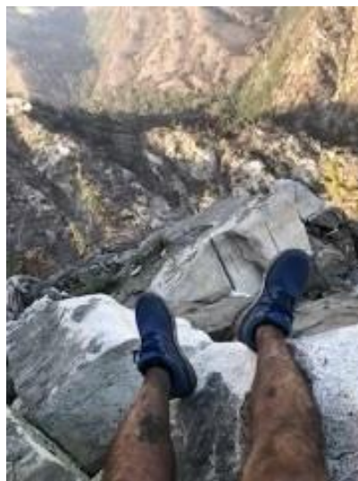
Photo that hiker posted on Twitter.