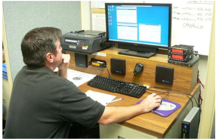
KK6CUS at Winlink position in EOC RACES Room during City/County RACES & MOU ACS Drill on October 3, 2015.