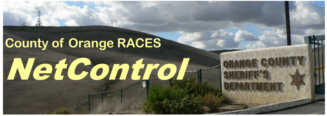
Newsletter of the County of Orange Radio Amateur Civil Emergency Service