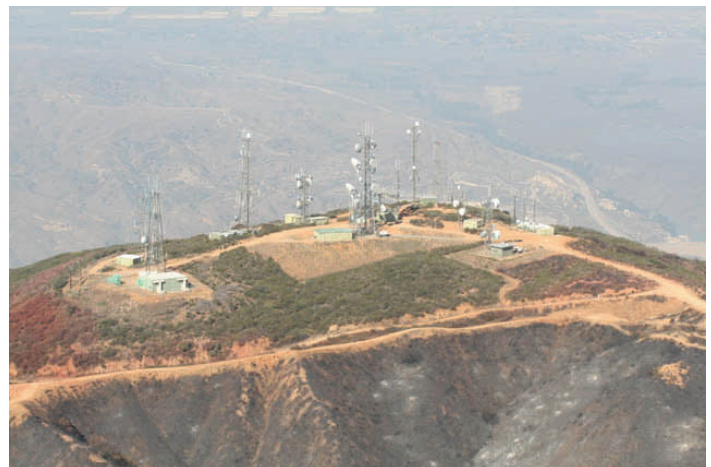
This picture shows just how close the fire came to the Sierra Peak radio site