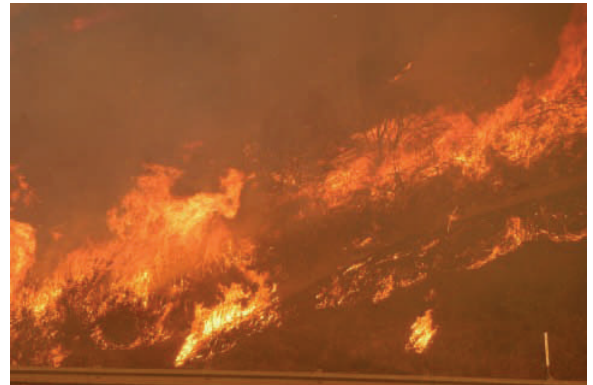
Hillside is consumed by fire