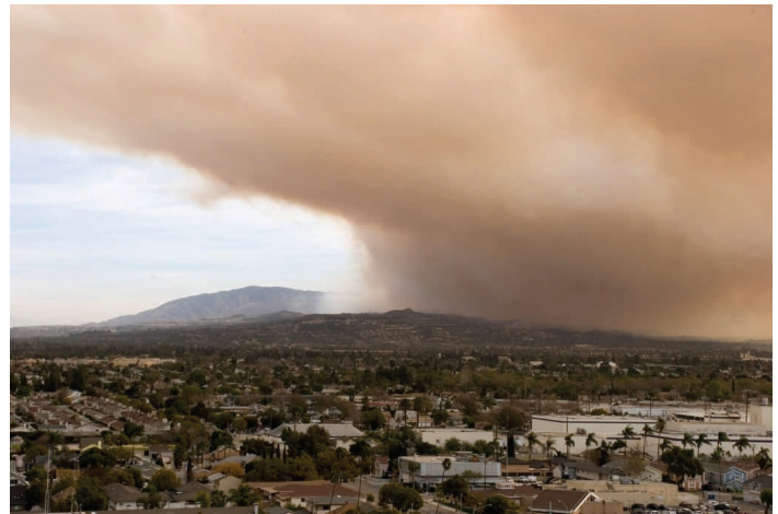
An ominous cloud of smoke hangs over North Orange County

OCFA expressed their appreciation for the OCRACES activation. Although we had advised that some of our members were trained for Severe Fire Weather Patrol duties, a patrol request was not issued. Afterwards, OCFA said they recognized the importance of OCRACES implementing Fire Patrols during critical RED FLAG conditions. We will schedule a training/review session on Patrol procedures at an upcoming OCRACES meeting.