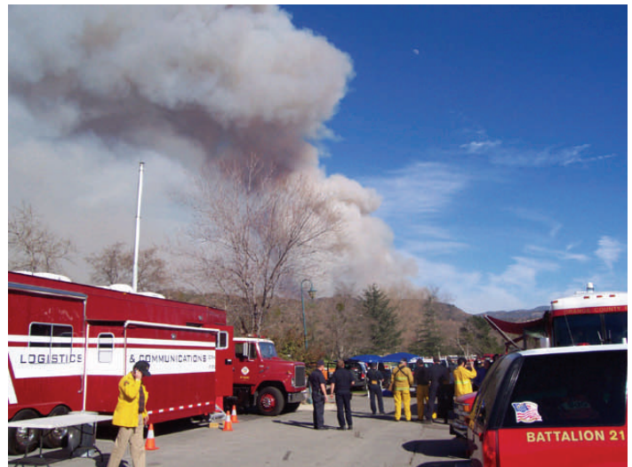
Unified Command was established at Irvine Regional Park