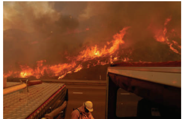
Above and below: Fire personnel took their stand along the 241 Toll Road to prevent the fire from reaching homes