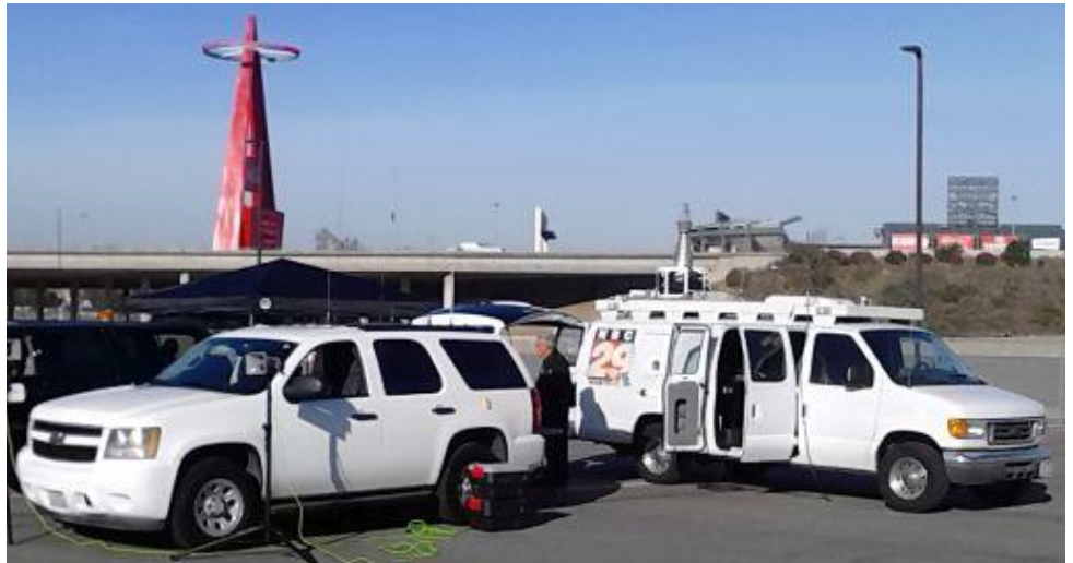
The Orange County segment of ACS Radio Rodeo was conducted in back of OCSD Communications & Technology Division in Orange, near the Santa Ana River and Angel Stadium of Anaheim (see the “Big A” in the background). Two vehicles were used for net control—OCSD’s Control 7 (left) on 2 m and 70 cm, and NI6E’s surplus news van on 40 m, 6 m, and 1¼ m.