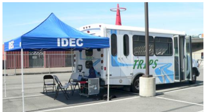
Buena Park RACES setup. Mission Viejo RACES field station. IDEC brought their new (still to be converted) van.