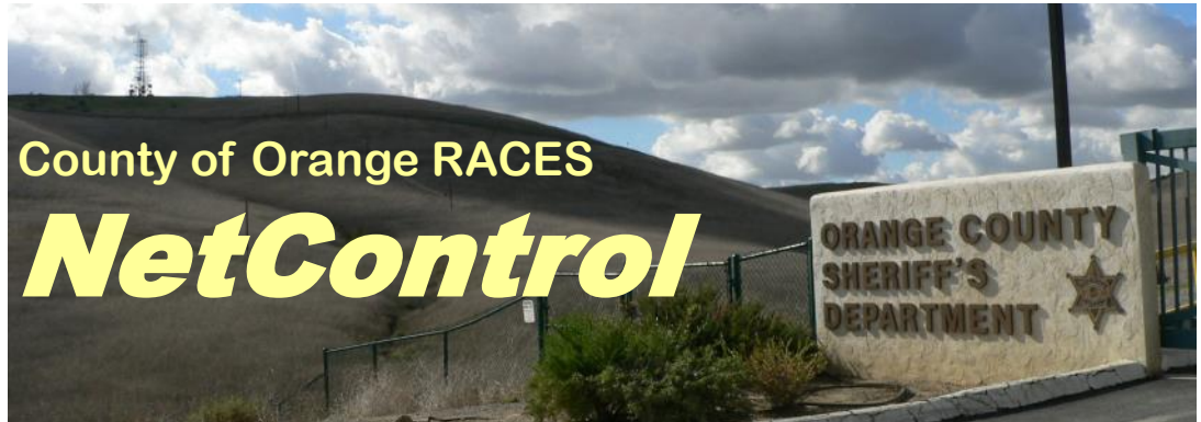
Newsletter of the County of Orange Radio Amateur Civil Emergency Service