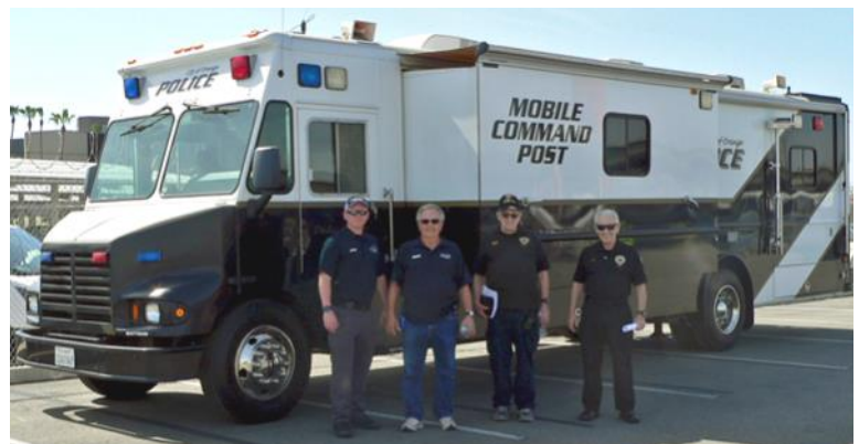
Anaheim RACES well-equipped communications trailer. COAR proudly displayed Orange PD's new mobile command post.