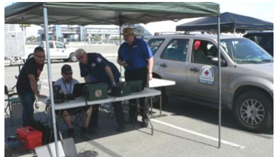
MESAC's KJ6PFW SUV station. Fountain Valley RACES field station. Red Cross vehicle and portable station.