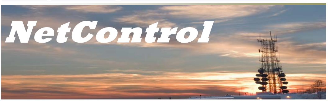
Newsletter of the County of Orange Radio Amateur Civil Emergency Service