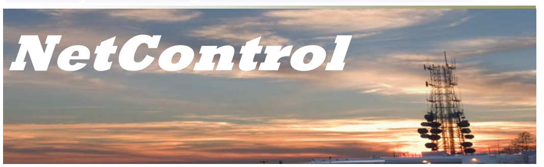
Newsletter of the County of Orange Radio Amateur Civil Emergency Service