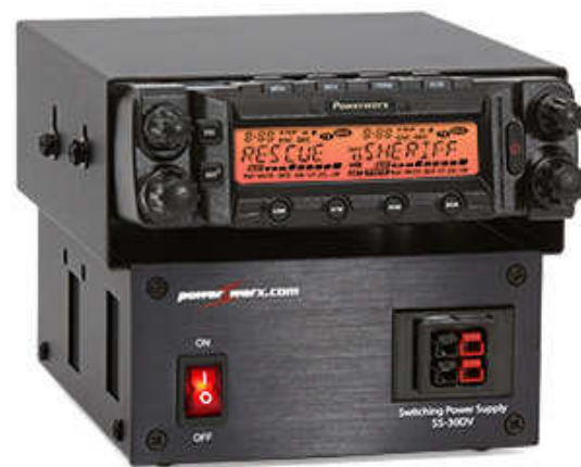
Powerwerx DB-750X VHF/UHF transceiver with optional MBXCOVR radio cover enclosure and SS-30DV power supply in a base-station configuration.

Standard accessories include removable control head, DTMF microphone, DC power cable, and mobile mounting bracket (with mounting screws). The price is $299.00. The optional MBXCOVR radio cover enclosure, which mounts to the optional SS-30DV power supply for base-station use, is $24.99. The SS-30DV is $119.99. The RPS-DB750X-US programming kit is $39.99.