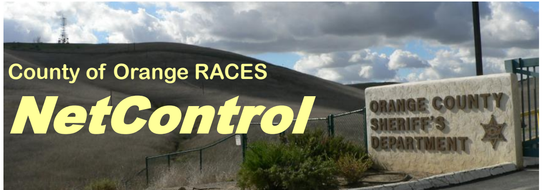
Newsletter of the County of Orange Radio Amateur Civil Emergency Service