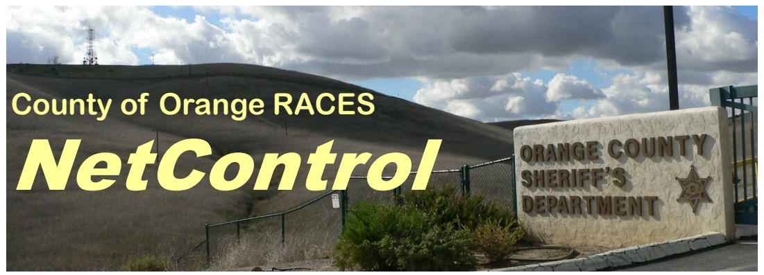
Newsletter of the County of Orange Radio Amateur Civil Emergency Service