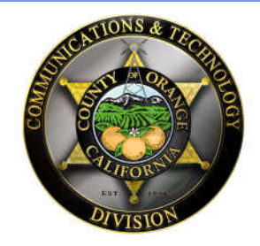
Orange County Sheriff's Department Communications & Technology Division