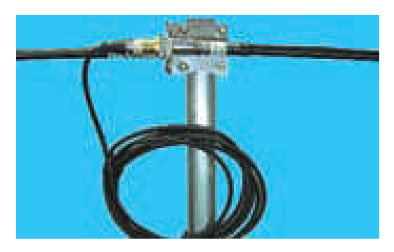
MFJ-2240 miniature dipole and coax balun.

Our NVIS experiments require using antennas with a very high angle of radiation (approaching 90 degrees or straight up). This would disqualify vertical antennas. Half-wave dipole antennas are much too large for mobile operation, and can be impractical for portable operation if no trees or other supports are available. Smaller horizontal antennas for portable operation are available, however, such as the Buddipole and MFJ BigEar (MFJ-2289). Two coilloaded HF mobile whips can also be connected into a center bracket to form a dipole. One configuration would be the MFJ-2275 (75 meters) or MFJ-2240 (40 meters) rotatable dipole, using two "HamTenna" whips (about 14 feet fully extended) or two "Short" HF mobile whips (about 6 feet total) into an MFJ-347 "HF Stick" minidipole mount that mounts on a mast up to 1<sup>1</sup>/<sub>4</sub> inches OD with an optional balun to isolate the feedline.