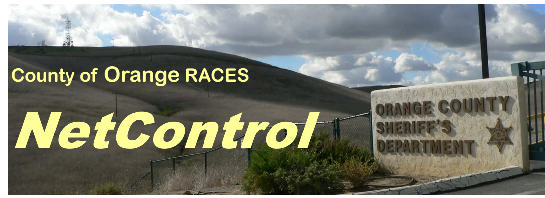
Newsletter of the County of Orange Radio Amateur Civil Emergency Service

Orange County Sheriff's Department Communications & Technology Division