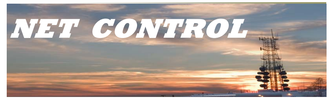
Newsletter of the County of Orange Radio Amateur Civil Emergency Service