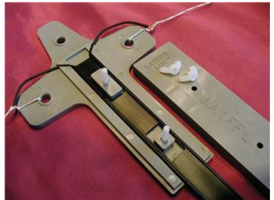
WA1FFL Ladder-Loc center insulator.

I will replace the MFJ fiberglass center insulator with a WA1FFL Ladder-Loc ladder-line locking center insulator, which provides better strain relief and mounting support for the ladder line. Instead of using