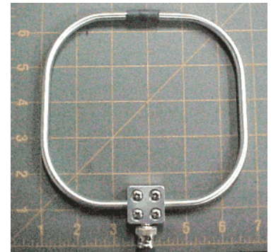
Arrow Antenna Model FHL-VHF compact fox-hunt loop covers 1 MHz to 600 MHz. The BNC connector mounts on an Arrow 4-MHz offset attenuator.

The cooperative T-hunts provide excellent practice in working together to find sources of interference. The hunts are not official RACES events, so DSW (Disaster Service Worker) coverage does not apply. Please drive carefully!