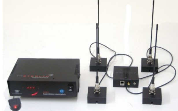
The Global TSCM Group Model DF-2020T/GPS Doppler direction finder with GPS can connect to a laptop to position and draw plots on Google Earth with the "Navi 2020" plotting program.

To resolve scheduling conflicts with RACES meetings, events, and County holidays in 2016, we have moved all cooperative T-hunts to the third Monday, except for the second Monday in October.