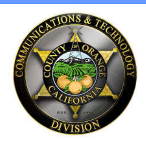
Orange County Sheriff's Department Communications & Technology Division