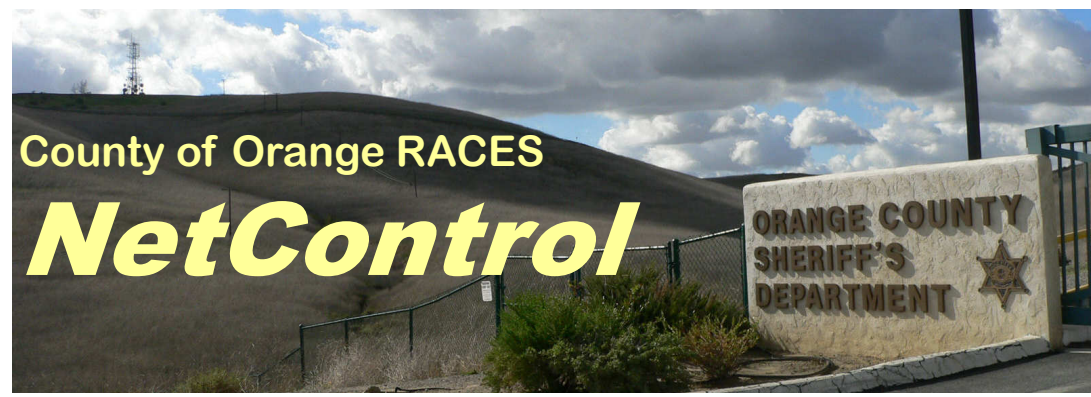
Newsletter of the County of Orange Radio Amateur Civil Emergency Service