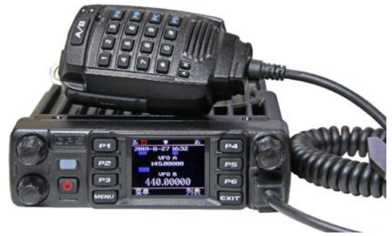
AnyTone AT-D578UVIII tri-band DMR/analog FM mobile transceiver covers 2 m, 1¼ m, and 70 cm.

At least a couple of dealers have announced the price to be $399.99. Delivery is predicted for December 2019.