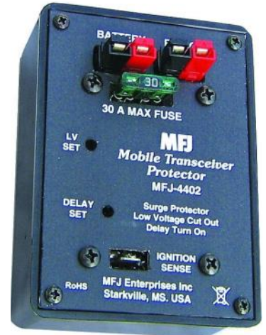
MFJ-4402 mobile transceiver protector comes in a 2½ × 4 × 1½ inch case.

Connections between the MFJ-4402 and the vehicle and the radio are made through Anderson Powerpole connectors for the high-current lines and a quick-disconnect connector for the ignition sense line.