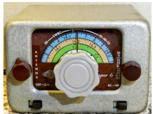
Gonset Super 6 converter allowed an automobile's broadcast radio to receive AM signals on the 80 through 10 meter ham bands.

Several years ago, I acquired a Kenwood TM-742A tri-band mobile transceiver (10 meters, 2 meters, and 70 centimeters) and began planning its installation in my Ford Explorer. I purchased a plastic mobile mounting console with a nice built-in speaker from Radio Shack. The radio had three audio outputs, one for each band, so I mounted two more speakers (Motorola) on the sides of the console. Some fellow hams mentioned to me that their mobile radios developed problems after starting their engines with the radios turned on at the time, perhaps caused by voltage spikes when starting, or by voltage drops. I also wanted my radio to turn off automati-