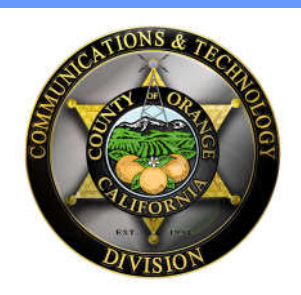
Orange County Sheriff's Department Communications & Technology Division