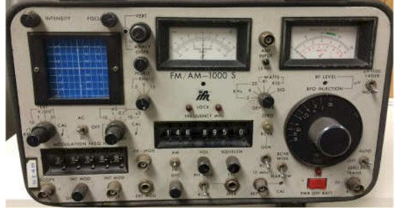
RACES Sgt. Bob McFadden, KK6CUS, has already put this IFR FM/AM 1000S to good use on the EOC RACES Room test bench.

Ray Grimes, N8RG, has generously donated an IFR FM/AM 1000S communications service monitor to OCRACES, and it is now on the test bench in the EOC RACES Room. The instrument consists of an FM/AM receiver, FM/AM signal generator, RF spectrum analyzer, RF frequency meter, RF wattmeter, dual-tone generator, RF demodulator, frequency standard, sweep generator/tracking oscilloscope, and DC to 1 MHz oscilloscope. Transmitter tests include frequency error, FM deviation, percent AM modulation, power output, harmonic content, frequency stability, and spurious outputs. Receiver tests include sensitivity, distortion, frequency stability, and frequency response. We caution whoever uses it never to transmit into it directly, and to turn it off and unplug it when finished with your tests.