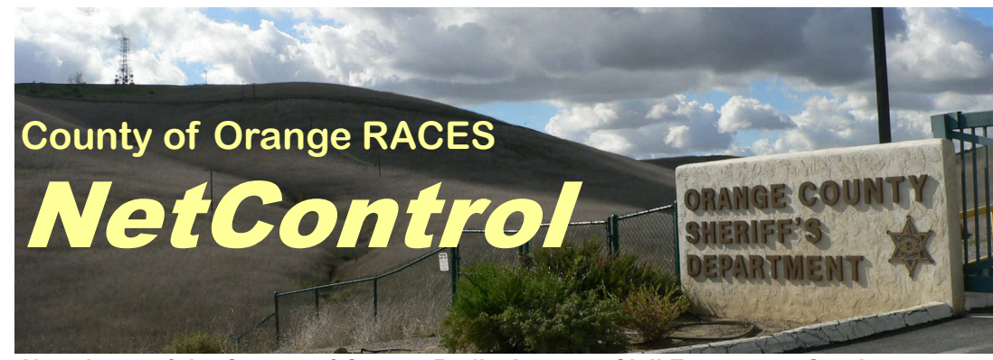
Newsletter of the County of Orange Radio Amateur Civil Emergency Service