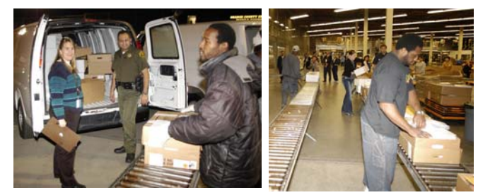
The boxes of electronic and paper ballots were transported from a Collection Center to the VTC and then unloaded for counting.

swers for the collection center personnel whose cell phones were not very useful. Thank you once again and I hope we can count on your support again in the future!