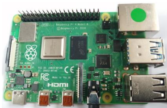
Raspberry Pi 4 Model B.

Upton said he anticipates the issue will be fixed in future board revisions, but until then, Raspberry Pi 4 owners will need to use non e-marked USB-C cables—the type many smartphone chargers use—with a power supply that can deliver the 5.1 V at 3A the board needs. Another option is to purchase the official Raspberry Pi 4 power supply, which costs around $8. Older chargers with A-C cables or micro B-to-C adaptors will also work if they provide enough power.