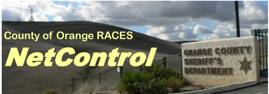
Newsletter of the County of Orange Radio Amateur Civil Emergency Service