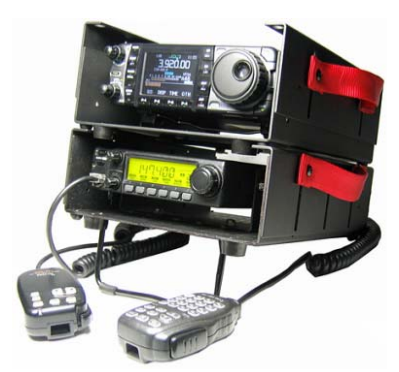
TRC-1 carriers are designed to stack one on top of another

The TAC-COMM Web site at http://www.taccomm.com features the TRC-1 Tactical Radio Carrier, which is a universally adjustable aluminum carrier designed to hold, organize, protect, and adapt a mobile radio and accessories to portable use in tactical operations. A radio may be mounted in the carrier with the supplied machine screws and nuts or with optional web strapping. The radio, microphone, and power cable may be kept packed, ready for deployment. The TRC-1 provides table-top or car-hood operation with tilt bail and stacking of multiple radios and/or power supplies. Adjustable sides of the TRC-1 accommodate radios of different heights, and can be extended to accept a radio and a TNC or other device in a single carrier. A radio and tuner or radio and power supply or radio and TNC may be strapped and stacked in one TRC-1, provided the combination does not exceed a height of 4.8 inches when the sides of the TRC-1 are fully extended. When the sides are fully collapsed, the height is 2.6