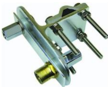
MFJ-347 mini-dipole mount combines two HamTennas, which have 3/8 x 24 threads, into a dipole.

the Yaesu FT-857D transceiver aboard the Division's Control Seven Tahoe may be used, feeding the vehicle's ATAS-120A mobile antenna. As an alternative, we could set up something like a shortened dipole antenna, using two MFJ-1640T HamTenna whips coupled together on an MFJ-347 "HF Stick" mini-dipole mount. The MFJ-347 mounts on a mast up to 1¼ inches OD. One possibility is the MFJ-1918EX portable tripod, which includes a 9.5-foot telescopic fiberglass mast, which collapses to 3.8 feet. Another antenna choice is a Buddipole portable dipole antenna system.