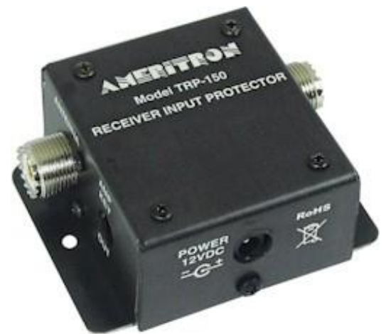
Ameritron Model TRP-150 receiver input protector.

Some transceivers do not have a second receiver but do have a separate receive antenna input, handy for low-noise loop or beverage antennas, for example. If you're using a separate receive antenna, the KD9SV Products Front End Saver eliminates the chance of accidentally destroying your radio's front end from a nearby strong