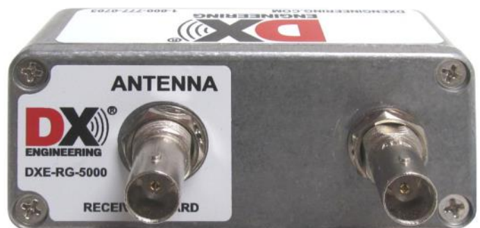
DX Engineering Model RG-5000 Receiver Guard.

When large signals are presented to the device, the input transformer saturates instantly, input VSWR increases, and the balance of input signal is reflected back toward the source. For this reason, power-handling capacity is mostly irrelevant. But even so, the components can handle approximately 10 watts ICAS (Intermittent Commercial and Amateur Service). Impedance of other signals at lower levels is undisturbed. Insertion loss from 1 to 75 MHz is typically 1 dB. Limiting begins and holds at approximately 0.7 Vrms, or approximately 10 dBm. A level of +5 dBm is 80 dB over S9 and is not often present in most single-operator stations. In a multi-operator station it is possible to see these levels on incoming receive antennas with no band-pass filters in line or where more than one station is active on a single band. Band-pass filters are recommended to limit the RF overload and to prevent RF from other bands getting in, and to further block possible harmonics reflected back to the antenna.