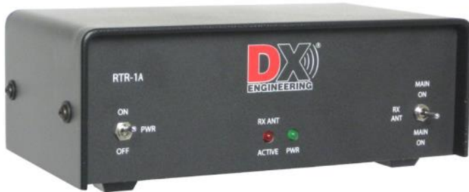
DX Engineering Model RTR-1A receive antenna interface.

protects an unswitched receive antenna port on a transceiver. It features a limiter circuit that passes normal level signals without affecting receiver intermodulation distortion (IMD). It also acts as a T-R antenna switch for older systems using separate transmitters and receivers. It's also handy for interfacing antennas to phasing or noise-canceling systems. An added receive preamplifier may also be protected by the RTR-1A.