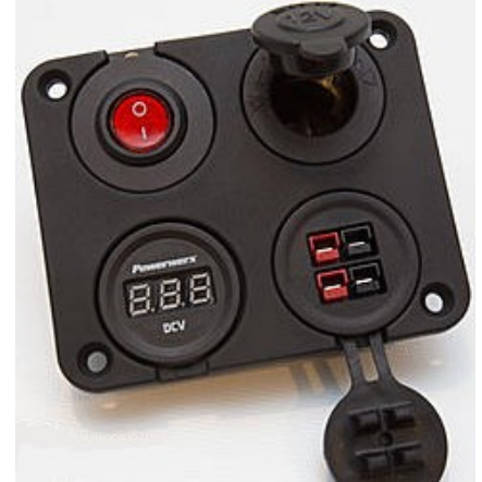
Powerwerx PanelPlate4 with PanelSW-Red 12-volt switch, PanelDVM digital red volt meter, PanelPole housing for two Powerpole connectors with a weather-resistant cover, and a marine-grade cigarette-lighter socket.

The Blue Sea Systems six-circuit fuse panel allows branching out from the single power wire running back from the main battery. It has an integrated negative bus that should be grounded to the frame near to the panel. The author mounted his inside the storage compartment in the bed of his Tacoma. This circuit panel is designed for marine use, so it can be mounted in the bed of a truck without worrying about getting it wet. The author ran the 4-gauge power wire from the battery, down the frame of his truck, and up to the Blue Sea fuse block. He mounted the 100-A circuit breaker as close as possible to the battery, protecting the system from a short circuit or accidental grounding situation. The power wire is also protected with plastic wire loom. The ground wire attaches to the frame below the fuse block.