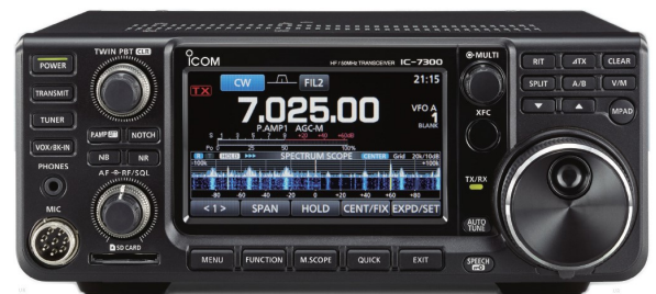
Icom IC-7300 HF plus 6-meter transceiver.

The new Icom IC-7300 HF plus 6-meter 100-watt transceiver uses a direct RF sampling approach rather than a conventional superheterodyne system. RF signals are directly converted to digital data and then processed in the FPGA (Field-Programmable Gate Array), which reduces noise. The "IP+" function improves the 3rd-order intercept point (IP3) performance, improving the ability to copy a weak signal that is adjacent to strong interference. In this process, the A/D converter is optimized to reduce or eliminate signal distortion. The TFT touch screen provides operational status including a real-time spectrum display with waterfall plus an audio scope. Features include a built-in tuner, voice memory, 15 bandpass filters, CW/RTTY memory keyer functions, RTTY decode, SD card slot, USB for CI-V and audio I/O, digital noise reduction, and 101 memories.