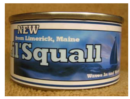
QRPme Lil Squall ][ Transceiver kit.

small personal size tuna can and has a silk-screened soldermasked PCB with plated through holes. A socket for the final transistor allows easy experimenting with output power. The feedback capacitors in the oscil-