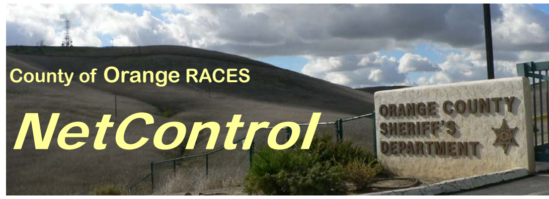
Newsletter of the County of Orange Radio Amateur Civil Emergency Service