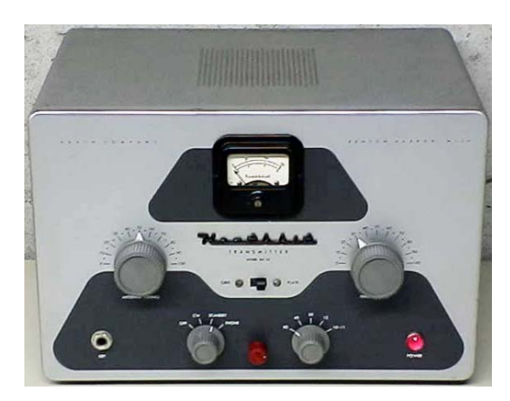
Heathkit DX-35 was an inexpensive and popular HF AM/CW transmitter kit, available from July 1956 to December 1957.

There is a resurgence in electronic kit building, reminiscent of the days of Heathkit and Knight Kit products, which were a great introduction to radio-electronics technology several decades ago. As I became a radio amateur in 1956 as a high-school student, I began building Heathkits and was thrilled seeing those connected parts come to life on the ham bands. It was sad to see Heathkit leave the amateur radio market many years ago, but now they promise to introduce some new ham radio products. Meanwhile, there is an increasing number of kit manufacturers, to keep the newcomers and well as us old timers busy on our test benches. My favorite is Elecraft, which offers the K3 HF transceiver in kit form (we have the factory-manufactured version in the EOC RACES Room), as well as the P3 panadapter and the KPA500 solid-state amplifier. However, Elecraft is a bit expensive for the average teen-ager getting into ham radio, but many other kits are available for newcomers on a limited budget, to acquaint them with the mysteries of radioelectronics. Some kits are directly related to amateur radio, while others cover other areas of electronics.