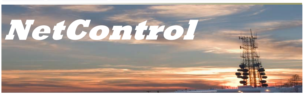
Newsletter of the County of Orange Radio Amateur Civil Emergency Service